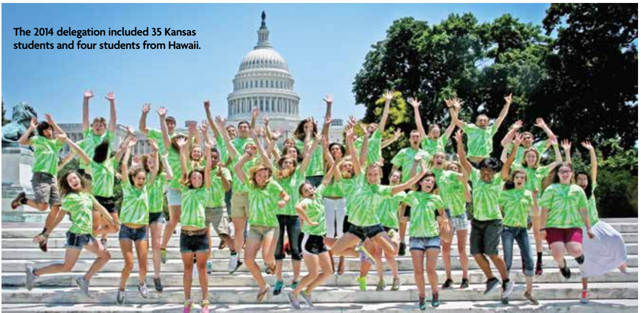
The 2014 delegation included 35 Kansas students and four students from Hawaii.

"When Senator Pat Roberts talked about tomorrow's leaders, it hit me that we are those leaders, and I want to strive to fulfill one of