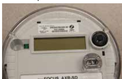
Press and hold the black button for 5 seconds to restore your service.

do not have an AMI meter, please contact 800-762-0436. For after hours assistance, please call 800-662-4246.