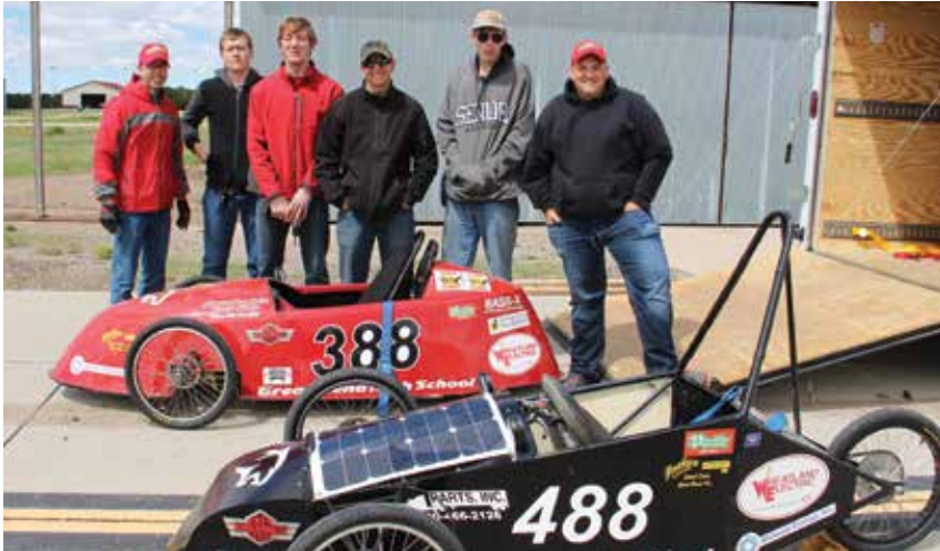
The Great Bend high school team prepares for the 19th Annual Sunflower ElectroRally.