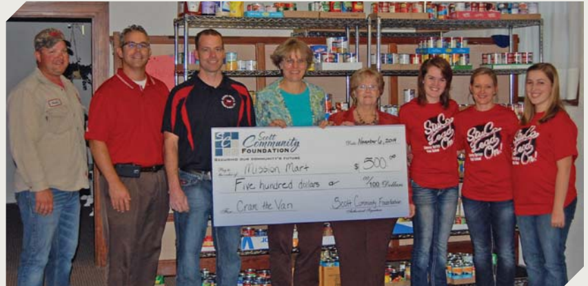
Mission Mart in Conway Springs received a $500 donation and 450 pounds of food from the “Cram the Van” food drive.