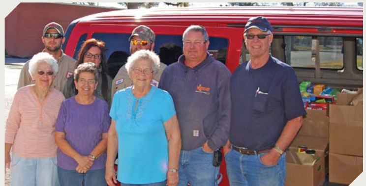
Wheatland’s Tribune office delivers 735 pounds and $250 to Greeley County Food Bank in Tribune.