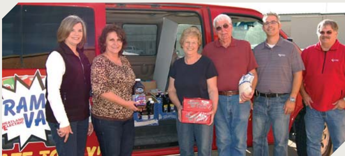
Wheatland staff presented the Barton County Food Bank with 300 pounds of food.