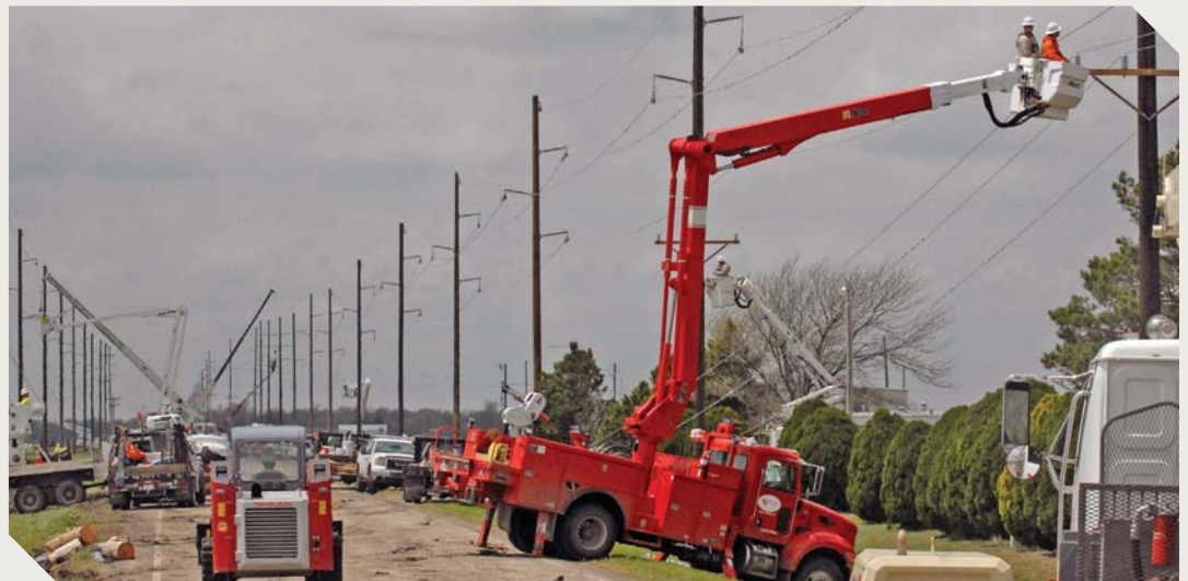
BOTTOM RIGHT: Wheatland crews restore power after a storm in the Great Bend area.