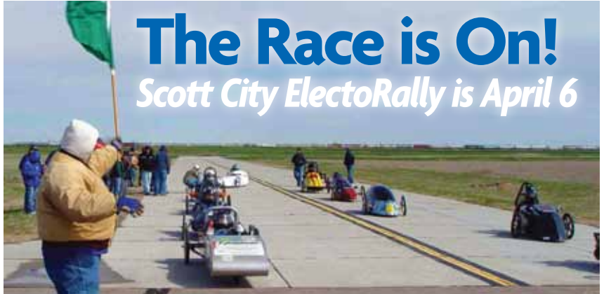
Racers line up to begin the 2010 Scott City race.

Mark your calendars to attend the ElectroRally in Scott City on April 6, 2011